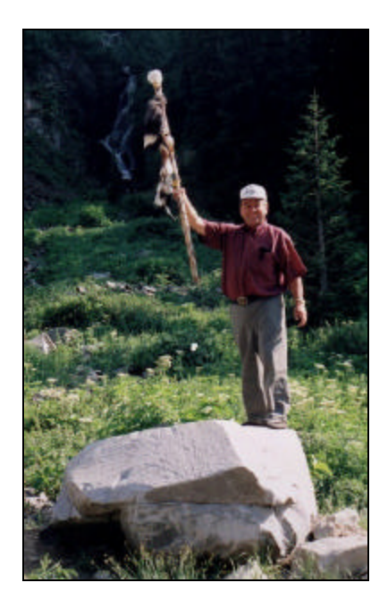
On This Rock

To all you guys out there, if you have questions or need help with VA benefits ask. Don't be so proud that you can't ask us B Co. or your local VA. There is much help out there. Take advantage of it now, as the sign says Uncle Sam owes you. I know your feelings first hand, we have to deal with many health problems from agent orange to diabetes to Post Traumatic Stress Disorder. We can deal with these things together, like we did when we were in Viet Nam. Trust in your fellow comrades again, we won't let you down. As your Chaplain I will do anything within my power to help you guys out at this time of your life.